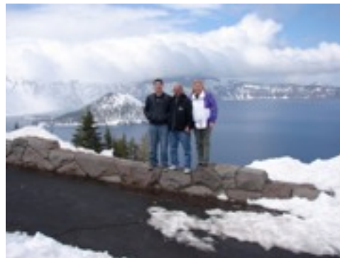
We took a day to go see Crater Lake in Oregon. A must see if you ever get out that way. The roads were just cleared for traffic that week. see below.