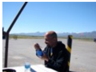
Stopping for a bite to eat on the long trip to Oregon,